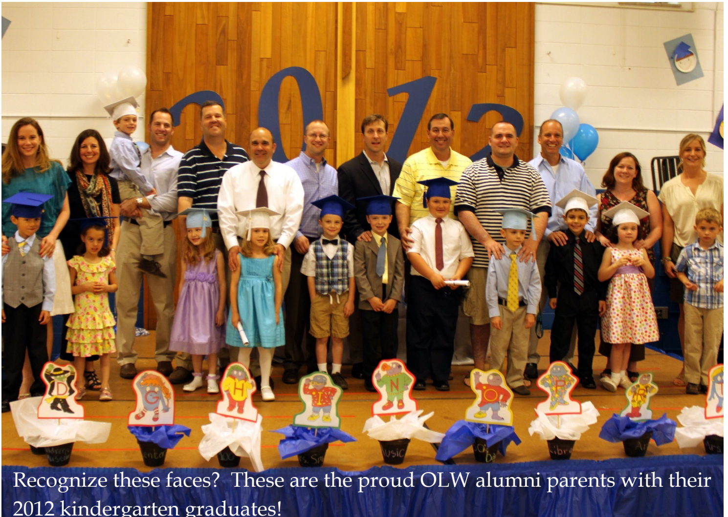
Recognize these faces? These are the proud OLV alumni parents with their 2012 kindergarten graduates!

Find us on Facebook & LinkedIn – We are excited to announce the recent launch of our Facebook page and LinkedIn Group. The Facebook page is intended to increase the dialogue among you, our alumni, so that you can reconnect with old classmates and friends and share photos and memories of your time at Our Lady of the Wayside School. Click the below link to find the OLV School Alumni page https://www.facebook.com/groups/523950037680556/ and search Our Lady of the Wayside Alumni on LinkedIn.